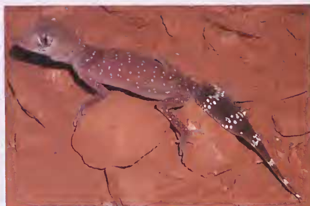
Plate 1. Underwoodisaurus milii at Packsaddle Range, Western Australia. The habitat on which this species was recorded can be seen in the photograph.

A further four specimens of U. milii (Plate 1) were collected from Packsaddle Range on the night of the 7 th of May 2004 (WAM R157513, R157520, R157522 and R157525). Three were captured on and around a graded track running through a major gully, with piles of broken